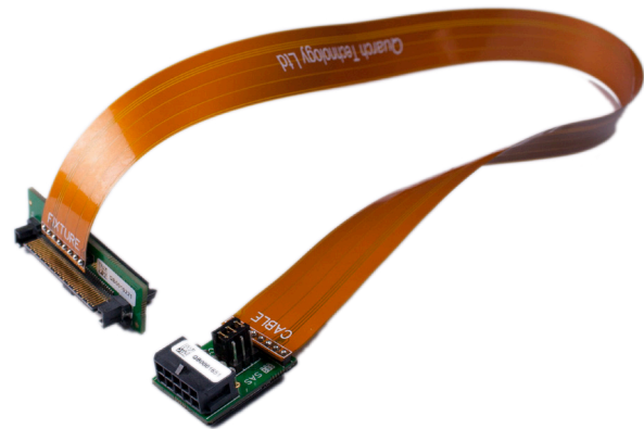
SFF Drive Injection Fixture