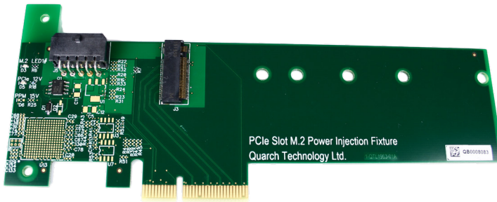
PCle Slot M.2 Injection Fixture