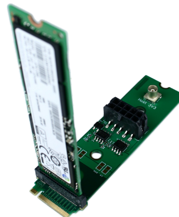
M.2 M-Key Vertical Injection Fixture