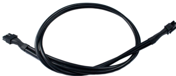
HD PPM Output Cable