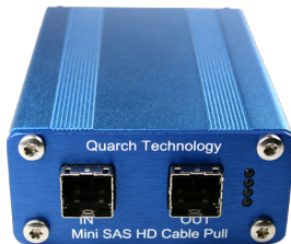
Cable Module - Main Unit